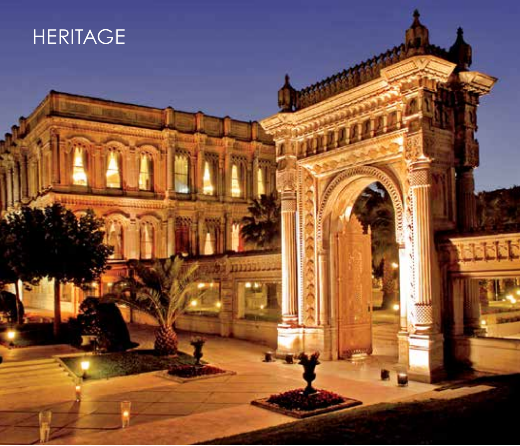
1. IST Palace; 2. Bosphorus Grill Cirağan Palace Kempinski; 3. One Bedroom Bosphorus View Palace Suite